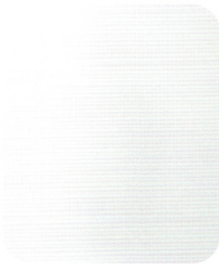
The obscuration achieved with a vase (as shown on the front cover) 40cm from Pilkington Optifloat™ Satin.