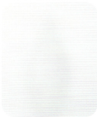
The obscuration achieved with a vase 20cm from Pilkington Optifloat™ Satin.