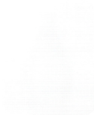
The obscuration achieved with a vase 1cm from Pilkington Optifloat™ Satin.